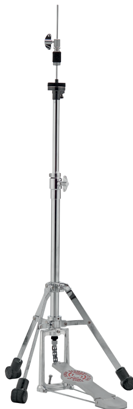
HH LT 2000