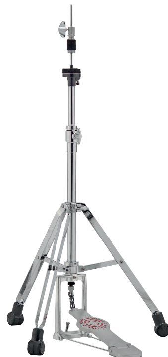
HH XS 2000