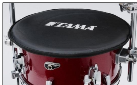
"Sound Focus Pad" SFP480 Bass Drum Mute Included (also available as single accessory)