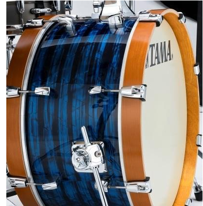
10"x20" Bass Drum w/ Satin Amber Wood Hoops