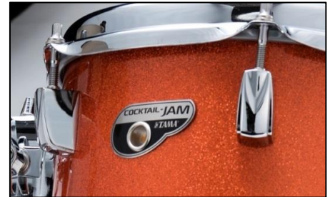
Newly Designed "Cocktail-JAM" Badge