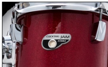
Newly Designed "Cocktail-JAM" Badge