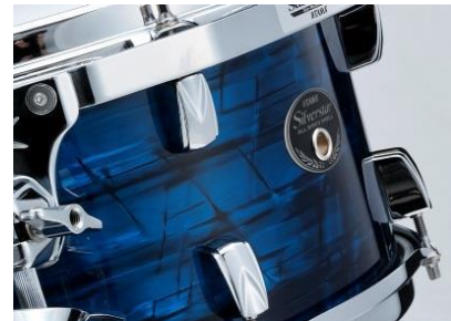
Blue Onyx (BLO)