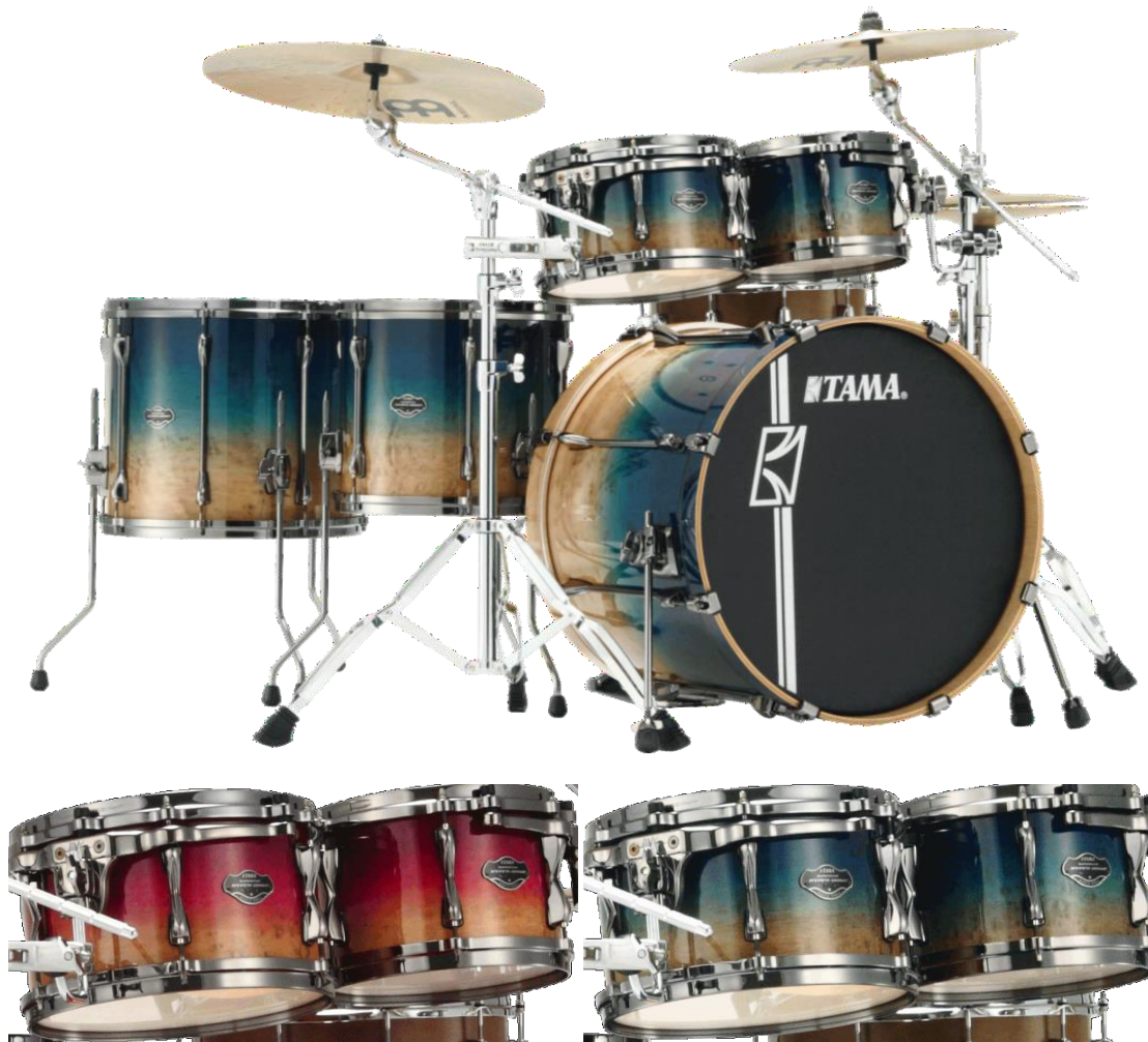
Figured Ruby Fade (FBF)

This Superstar Hyper-Drive kit is a limited-edition model that features a beautiful Figured Maple outer ply. The vibrant contrast between faded finishes and black nickel hardware complement its beautiful wood grain. In addition, the Superstar Hyper-Drive offers superior specifications, such as an all-maple shell, die-cast hoop, and Star-Cast mounting system, which deliver a punchy, clear attack. The Superstar Hyper-Drive limited kit is sure to impress, in terms of both looks and sound.