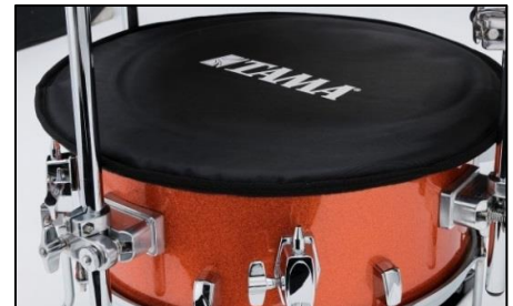
"Sound Focus Pad" SFP530 Bass Drum Mute Included (also available as single accessory)