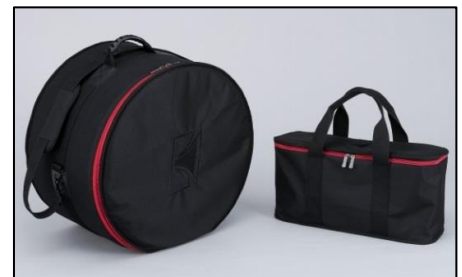
Come with Drum &amp; Hardware Bags