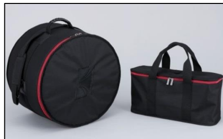
Come with Drum &amp; Hardware Bags