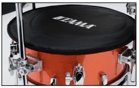
"Sound Focus Pad" SFP530 Bass Drum Mute Included (also available as single accessory)