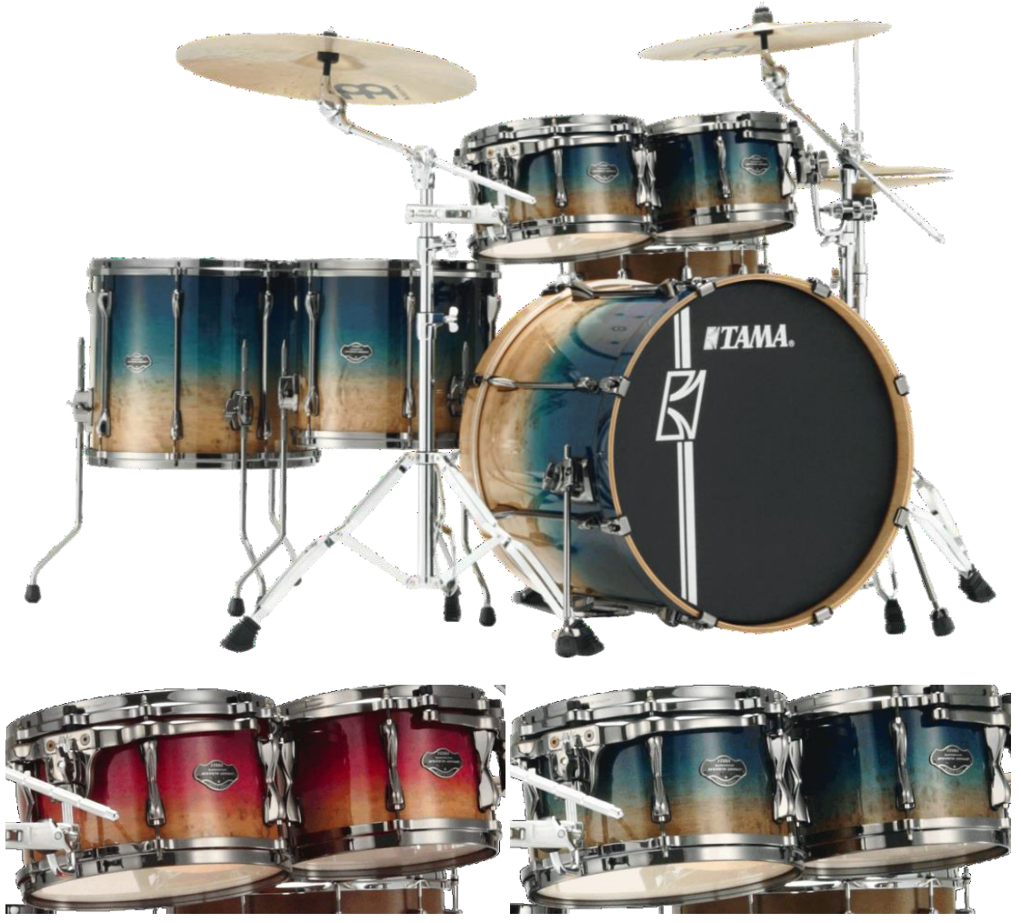
Figured Ruby Fade (FBF)

This Superstar Hyper-Drive kit is a limited-edition model that features a beautiful Figured Maple outer ply. The vibrant contrast between faded finishes and black nickel hardware complement its beautiful wood grain. In addition, the Superstar Hyper-Drive offers superior specifications, such as an all-maple shell, die-cast hoop, and Star-Cast mounting system, which deliver a punchy, clear attack. The Superstar Hyper-Drive limited kit is sure to impress, in terms of both looks and sound.