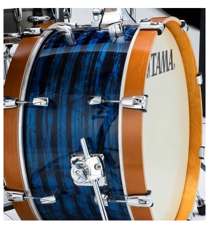
10"x20" Bass Drum w/ Satin Amber Wood Hoops