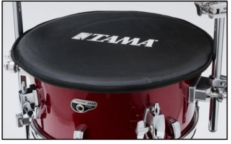
"Sound Focus Pad" SFP480 Bass Drum Mute Included (also available as single accessory)