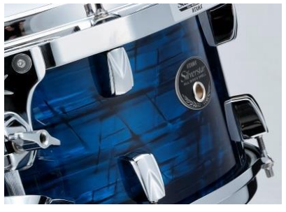
Blue Onyx (BLO)